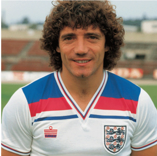
Kevin Keagan for England

During the mid 1990s, & after a period of relative inactivity, the Admiral Trademarks were acquired in 1997 by Hay & Robertson plc, and ownership was transferred to International Brand Licensing in a demerger in 2002.